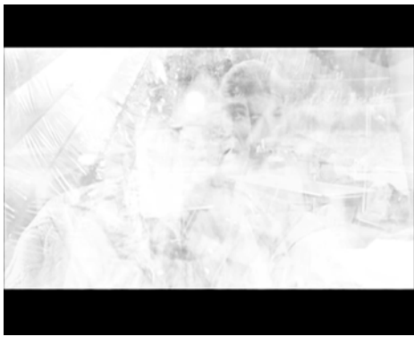
Ambient Horror (Day of the Dead Fifteen Layers) - Graham Gussin (2006)

Reflecting Gussin's frequent dialogue between the structural and the sublime, this striking aesthetic experience, here premiered, looks like a breathing Turin Shroud. The cinema screen acts as a boundary onto a world of ghostly lost souls, trapped, trying to penetrate or find their way out of the layered images of Day of the Dead in which they find themselves caught.