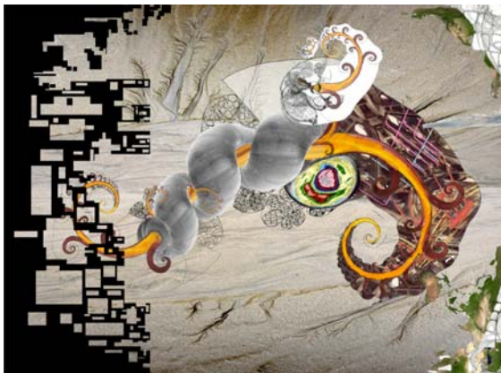
Paraculture/Future Garden Structure - Hilary Koob-Sassen (2005)

The camera trails said guide on a tour through the labyrinthine complex of Ogiamen's palace in Benin City, presenting ruptured dialogues between seeing and understanding, tradition and the contemporary. The extraordinary building was constructed in the 12th century and is one of only a handful of houses that survived the British punitive expedition of 1897, and remains inhabited to this day.