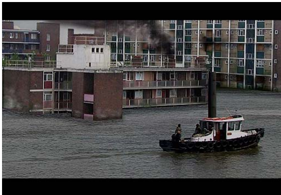
Polly II - Plan For a Revolution in Docklands - Anja Kirschner (2006)

Song and images of organic matter mix to tell the story of how we make and interpret the world but also to propose a new model for the organization of the economy.