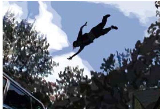
Waking Life - Richard Linklater (2001)