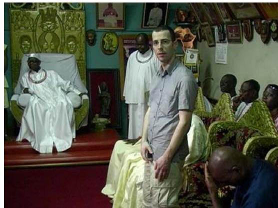
The Visitor – Uriel Orlow (2007)